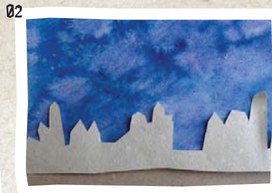
voice: the city grows and grows... the camera stays still