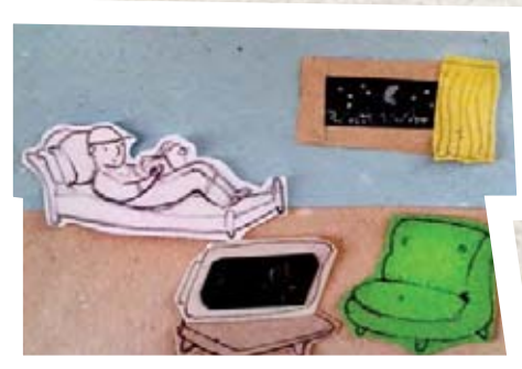
cut to the student's apartment