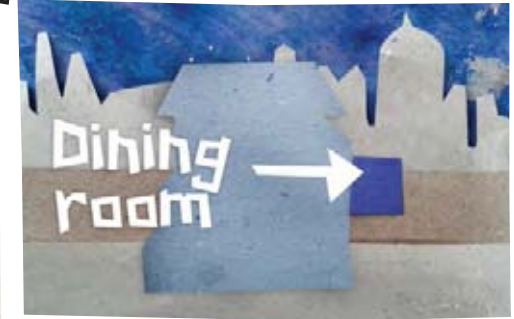
a quick overview of the building- highlighting the dining-room