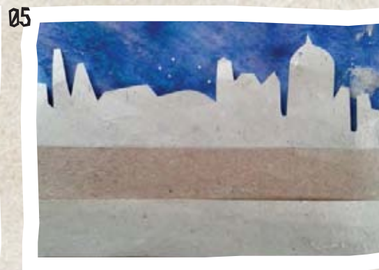
the camera scrolls to a building site.