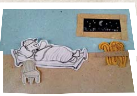
cut to the senior's apartment