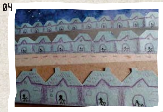
voice: ...typically people with the same life-style will tend to create groups and stick together...and live in the same type of house zoom in-in the city: the "ghetto" areas