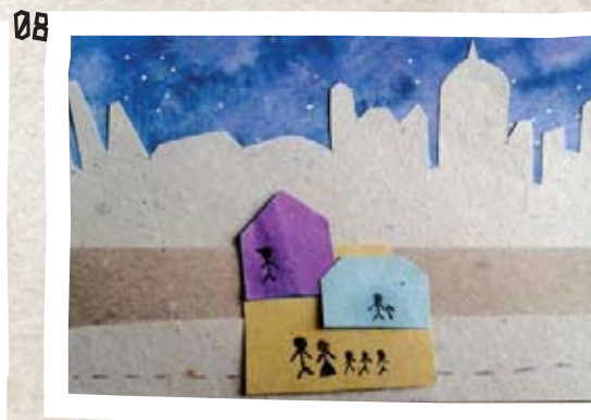
the camera stays still voice:...people of different age start living together?