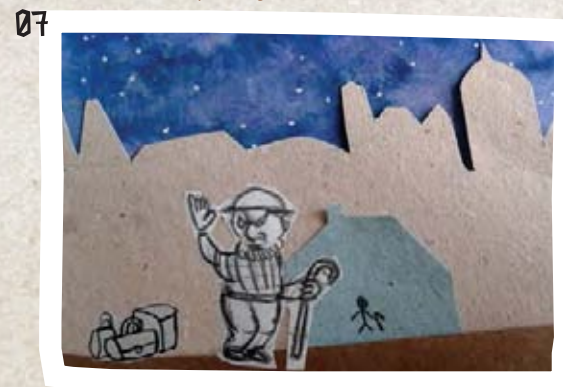
from symbol to person: an old man moves to the new house