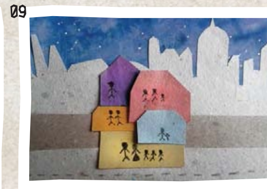
voice: families, students, elderly, singles under the same roof?