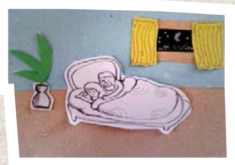
cut to the couple's apartment