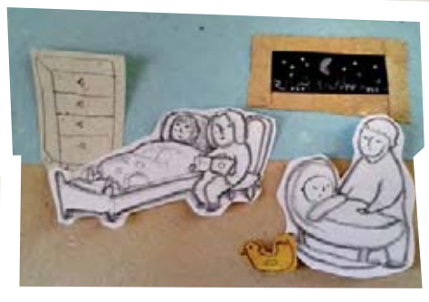
cut to the family's apartment