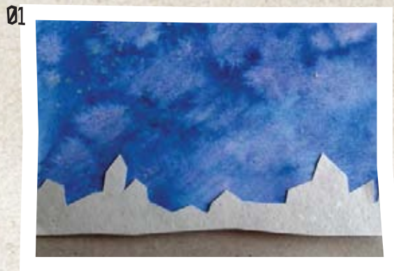
voice: every day people from the countryside move to the city... the scene appears from dark.

this storyboard does not represent the final visual result. it is though a sketch that gives the idea of the stile and the mood that is going to be used in the film.