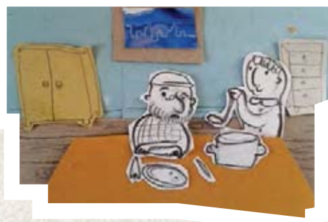
switch into the dining room.