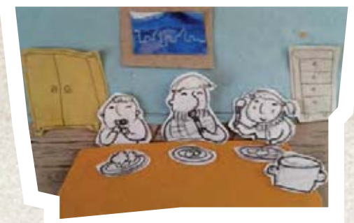
voice: a common meal is much more fun, both to cook and to eat, when you are in good company, and increases appetite.