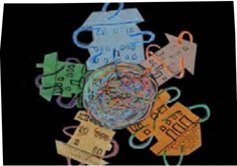
zoom out: nighttime