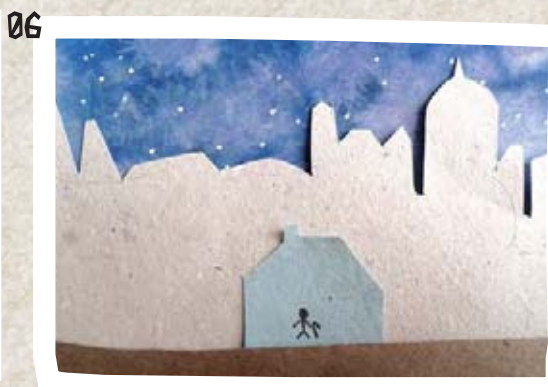
voice: what happens if..." here an "elderly-house" pop-up